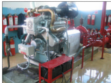
Kelair specialises in repowering of fire pump units (Picture on left 'before' - on right 'after').